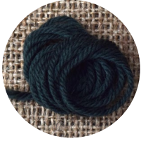
A: 2396 Spruce