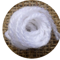
A: 40 White