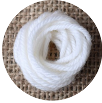
A: 2365 Birch