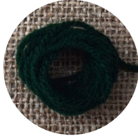
A: 45 Forest